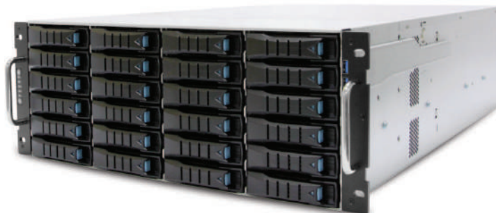
Optional item - Front door